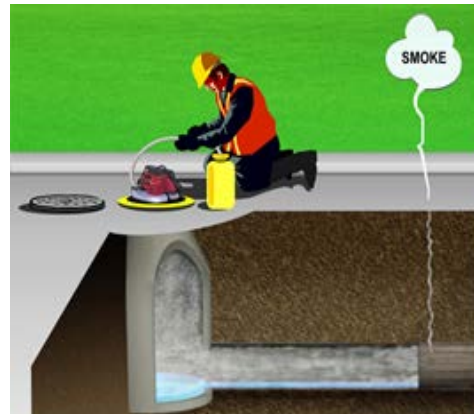
When a sewer system is filled with smoke, leaks can be visually detected.

During ‘smoke’ testing, field crews blow air and ‘smoke’ into the sanitary sewer system in the street and easements, and monitor where ‘smoke’ escapes the system. The ‘smoke’ under pressure will fill the main line as well as any connections and then follow the path of any leak to the ground surface, quickly revealing the source of the problem. For instance, if ‘smoke’ permeates up through a yard, it indicates breaks in the sewer line. Only enough force to overcome atmospheric pressure is required, and ‘smoke’ should escape from building roof vents. If you have any doubt as to the source of the ‘smoke’ in your home or yard, contact 911 immediately.